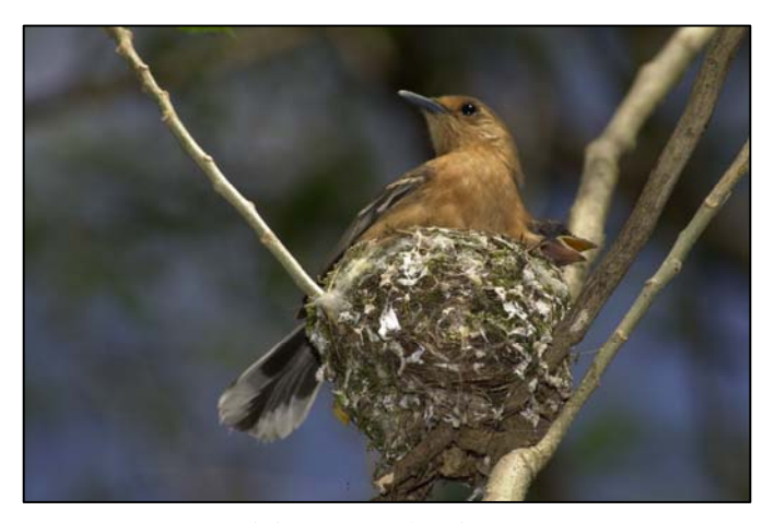
Tinian Monarch at its nest